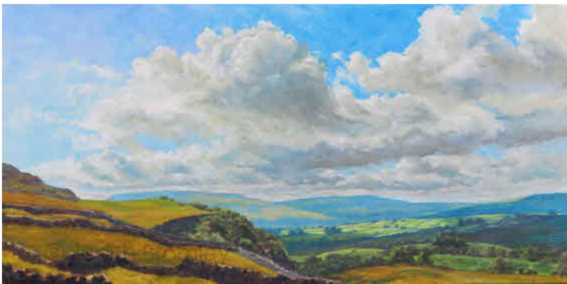
FAIR WEATHER Oxclose, Haw Bank and Ladyhill