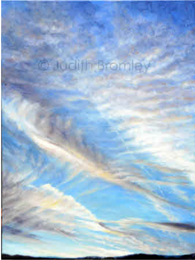
JULY EVENING SKY