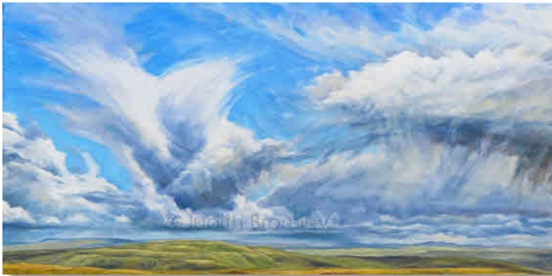
...AND BURSTING OUT Looking south from Buttertubs