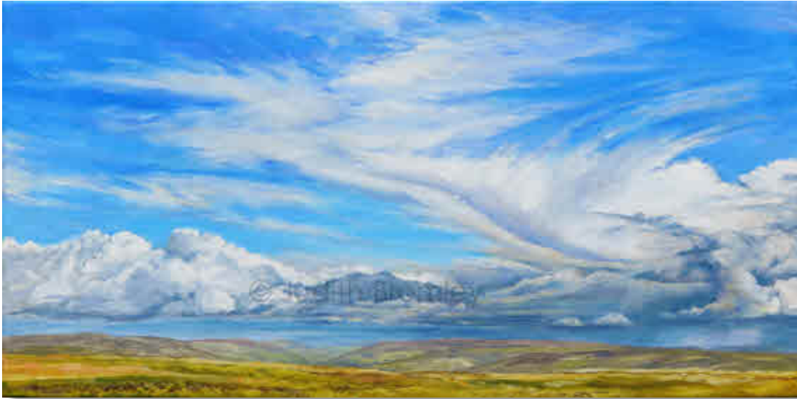
SURGING UP... Looking south from Buttertubs