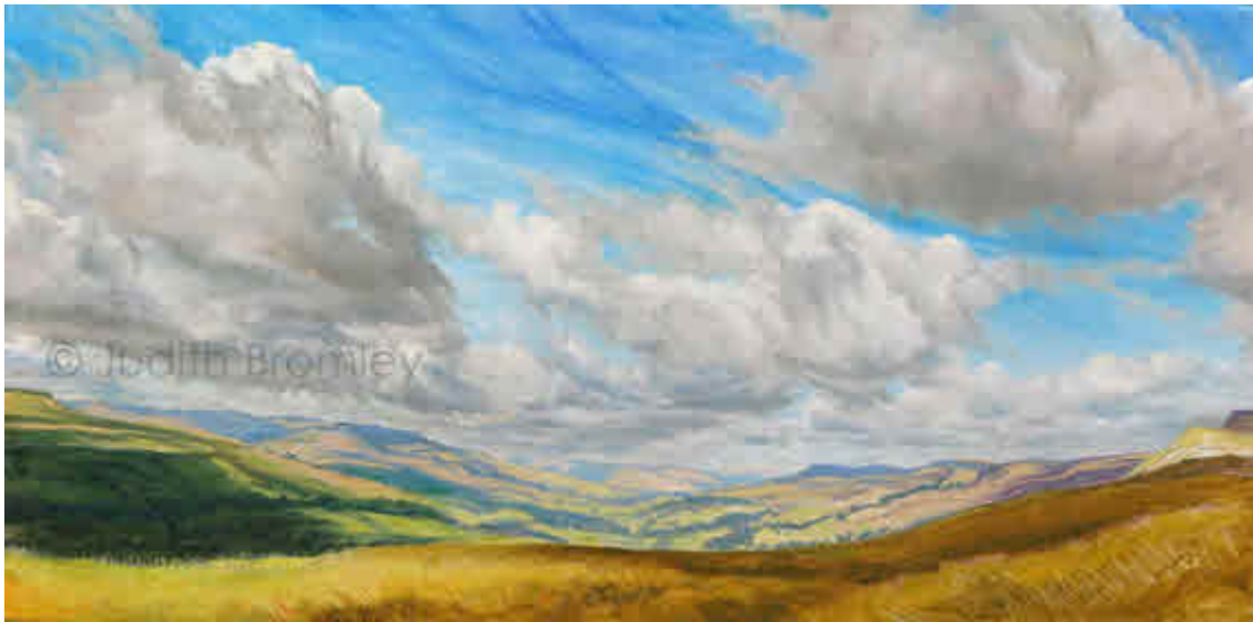
BILLOWING AND DRIVEN Updale from below the Greets 100 x 50 x 4.5 cm £1500